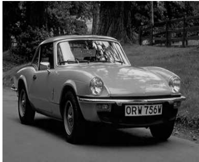
(a) Original image