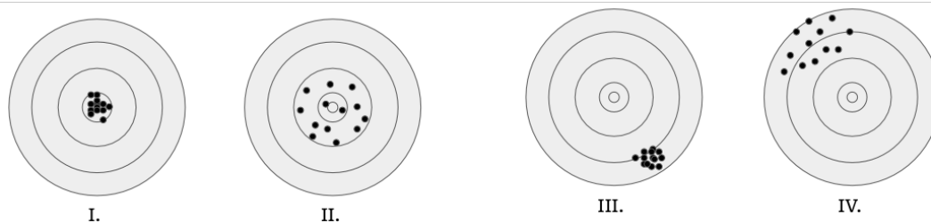
Figure 1: The following graphic will be used as a representation of bias and variance. Imagine that a true/correct model is one that always predicts a location at the center of each target (being farther away from the center of the target indicates that a model's predictions are worse). We retrain a model multiple times, and make a prediction with each trained model. For each of the targets, determine whether the bias and variance is low or high with respect to the true model.

(8) In Figure 1, subplot I, how are bias and variance related to the true model?