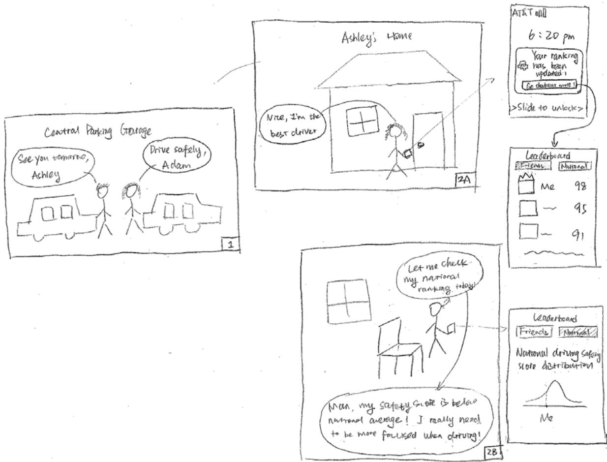
Figure 2: Sharing and Comparing Driving Habits