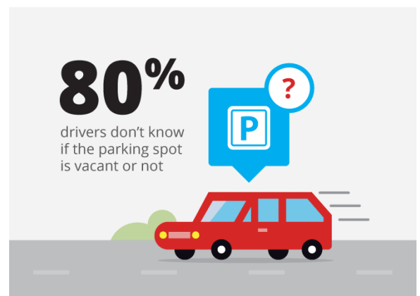
3 biggest parking problems