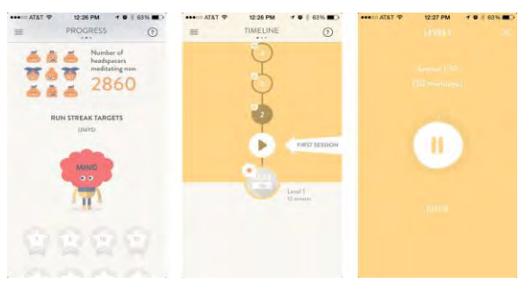
Figure 2. Screenshots from Headspace i Phone app depicting meditation goals.