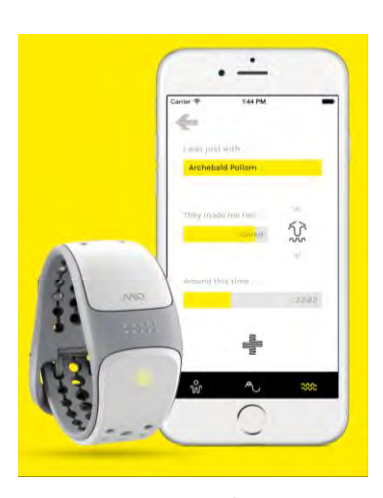
Figure 3. Screenshot from Ppl kpr application and optional wearable biometric sensor.