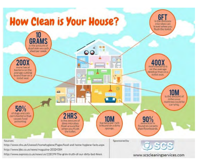
Figure 2: The importance of maintaining a clean house.