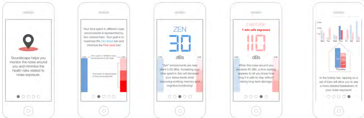
New Tutorial Screens

There were also minor changes throughout, including adding more information on the detail page. With smaller (i.e. not handwritten) text, we could include detailed breakdowns of high, medium, and low risk in the bars themselves and add averages below each of the graphs. We also omitted the “More Info” question mark icon and Sound chart from earlier designs as most of that information was covered in the added Tutorial. Though our digital mockup will no doubt see more revision in the future, we believe that our design is solidifying and future changes (though still important) will be much smaller in scope and implementation.