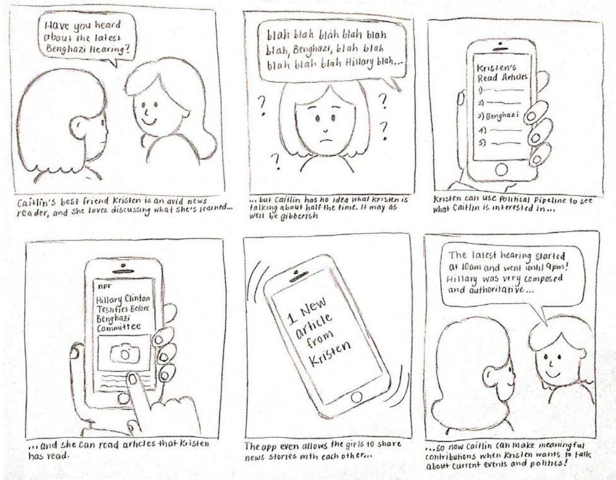
Figure 1 "Socializing with Friends, Both Online and Offline"