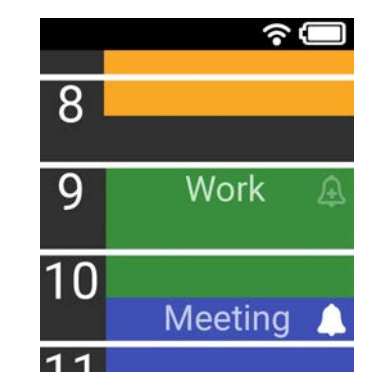
Stay in Sync With Your Online Schedule