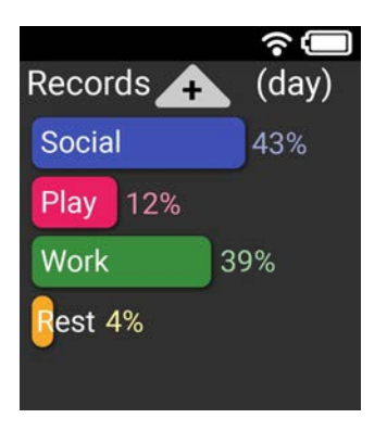
Learn How You Spend Your Time