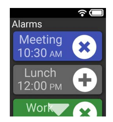
Set Reminders to Switch Tasks