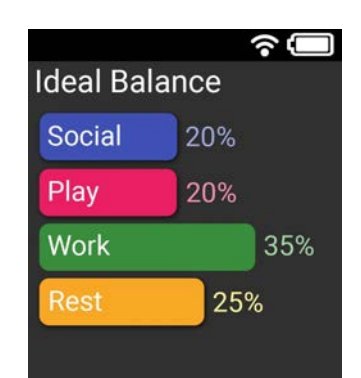
Achieve Your Ideal Balance