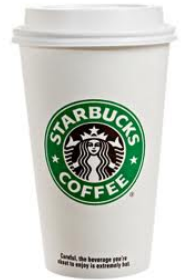
Figure 1 Buying a latte 6 times a week could lead to spending almost $1,300 per year

We all do it. We all have something that we habitually (or non-habitually) break down and buy whether it be that $4.15 Starbucks latte, $5.00 beer after work, $10.50 movie ticket, $8.00 cocktail, $6.12 pack of cigarettes, $1.79 bottle of soda, $22.99 new shirt... The list can go on and on. The point is that people who have extra to spend, always spend extra. It is one of the perks of being in a comfortable financial state. However, small and medium purchases are often overlooked because of the minimal dollars spent at one time, hurried purchases, and social outings. This creates an unawareness of total expenditures. All of these “little” purchases tend to add up without the buyer realizing because each purchase always seems so “little” at the time. Consider getting a Starbucks latte one day. It is only $4.15 right? Wow, less than five dollars. Now, consider buying a latte six times a week: $24.90, per month: $99.60, and per year: $1,294.80. That is a significant amount of dough for that less-than-five-dollar latte. This leads to the question, where am I actually spending my extra money, what exactly am I spending it on, and how much am I spending on certain items? These questions need to be answered and reflected upon in order to allow us to really use our hard-earned money in the way that we actually want to in more long-term and planned-out way.