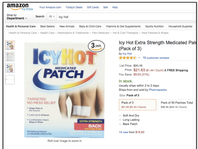
Average cost of one pad at Amazon $1.44

Looking at these different forms of relief, each has their benefits and issues. With products like Icy Hot pads, they provide immediate relief to specific areas, but they produce waste and if used regularly, can be costly to the user. In the case of pain relief drugs, they are stronger and can usually last longer. However these drugs also may have side effects and there is a risk of addiction for prescription drugs and as shown in the figure there has been an increase in death from overdoses.