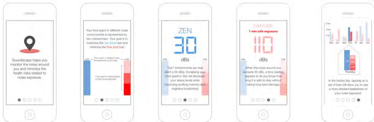
New Tutorial Screens

There were also minor changes throughout, including adding more information on the detail page. With smaller (i.e. not handwritten) text, we could include detailed breakdowns of high, medium, and low risk in the bars themselves and add averages below each of the graphs. We also omitted the “More Info” question mark icon and Sound chart from earlier designs as most of that information was covered in the added Tutorial. Though our digital mockup will no doubt see more revision in the future, we believe that our design is solidifying and future changes (though still important) will be much smaller in scope and implementation.