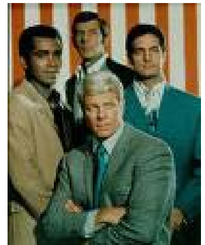
Mission Impossible Team