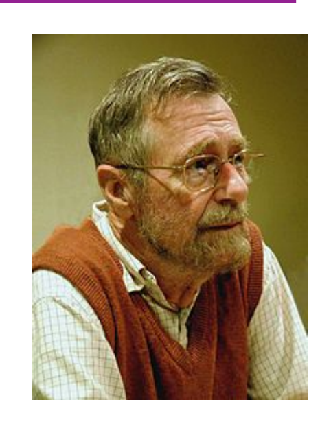
Edsger Dijkstra 1972 Turing Award Lecture

"Program testing can be a very effective way to show the presence of bugs, but is hopelessly inadequate for showing their absence."