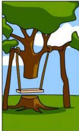
How the Analyst designed it