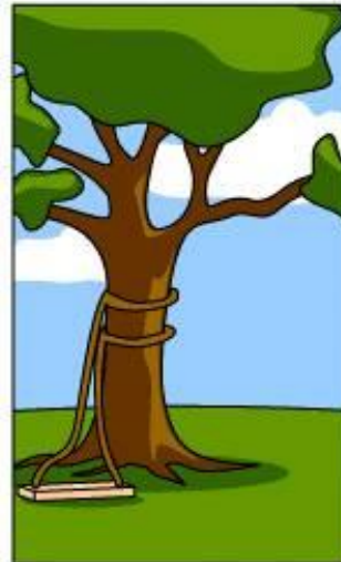
How the Programmer wrote it