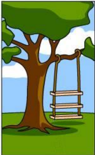
How the customer explained it