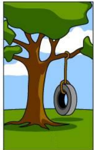
What the customer really needed