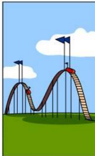
How the customer was billed