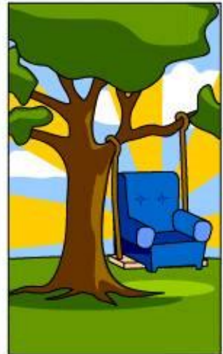
How the Business Consultant described it