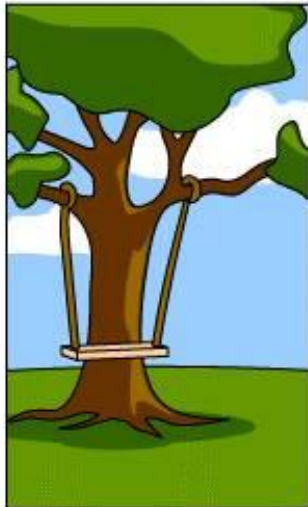
How the Project Leader understood it