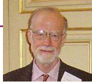
Sir Anthony Hoare

The first method is far more difficult.”