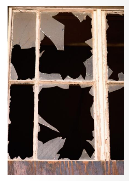
It's like a broken window!