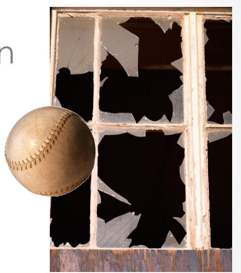
Don't break your own window, yo.