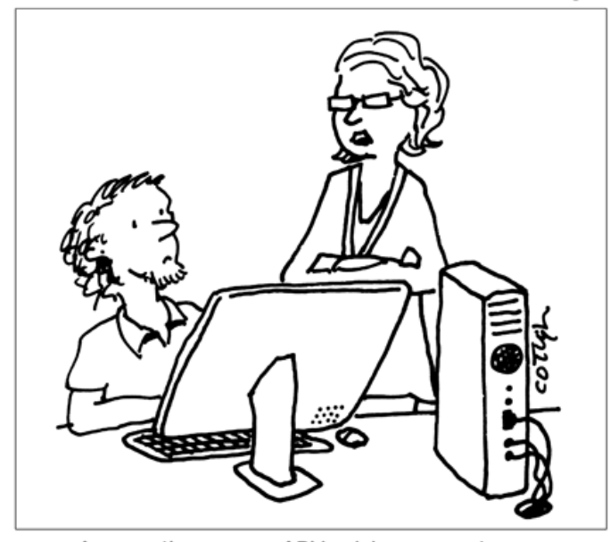
Apparently our open API is giving our customers unprecedented control over their own lives and allowing them to seize control of their destinies. So please shut it down.