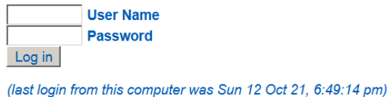
start.php displaying last-login cookie

On the todolist.php page, next to the "Log Out" link, display text indicating how long the user has been logged in during their current session based on the value of this cookie. On the start.php page, if the cookie exists, display the last date/time the user logged in from this computer.