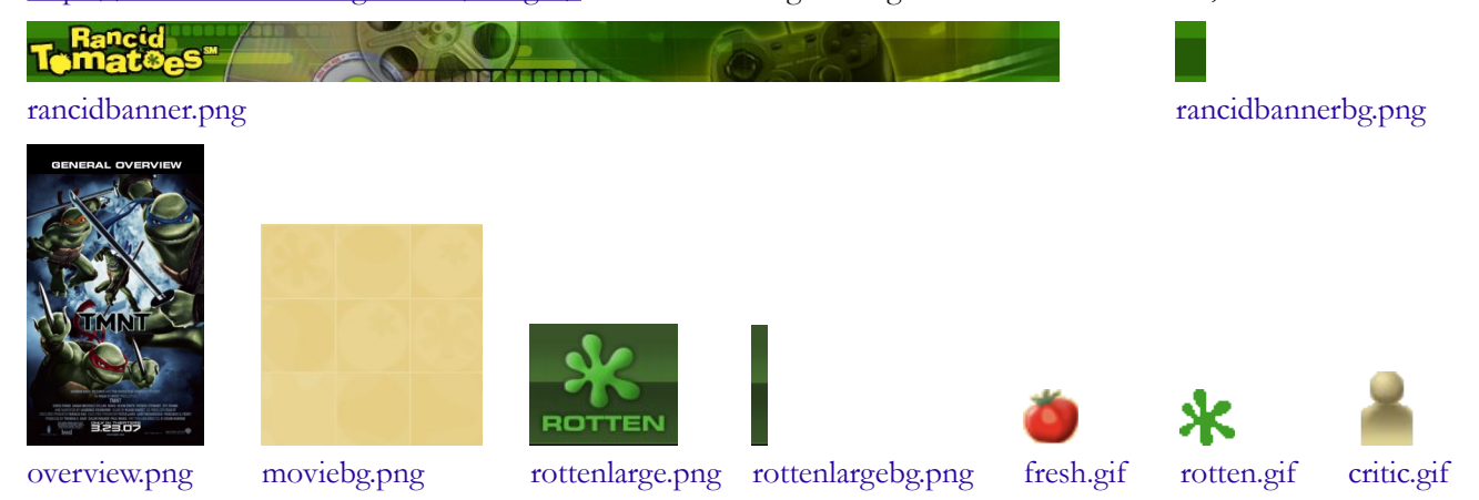
The page's title is: TMNT - Rancid Tomatoes

All images on the page and mentioned in the following text are hosted on the web in the folder <a href="https://webster.cs.washington.edu/images/">https://webster.cs.washington.edu/images/</a>. Link to all images using their full absolute URLs, not relative ones.