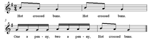
Hot Crossed Buns

Music is usually printed like the example on the right. The notes are a series of dots. Their position in relation to the lines determines their pitch and their tops and color, among other things, determine their length. Since it would be difficult for us to read input in this style, we will instead read input from a text file.