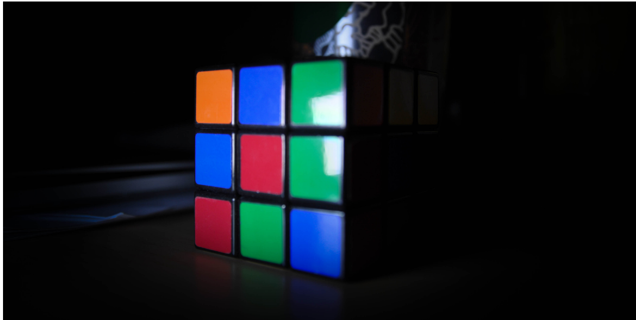
Different views from different lights