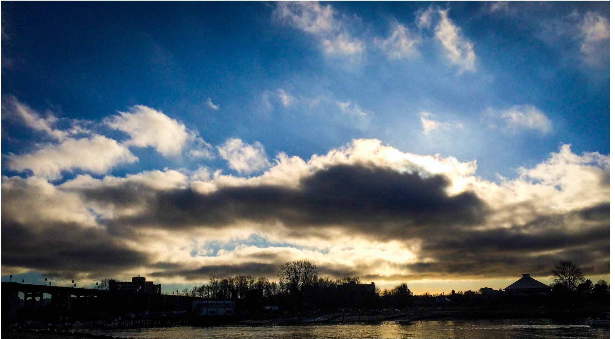
Light of sunset