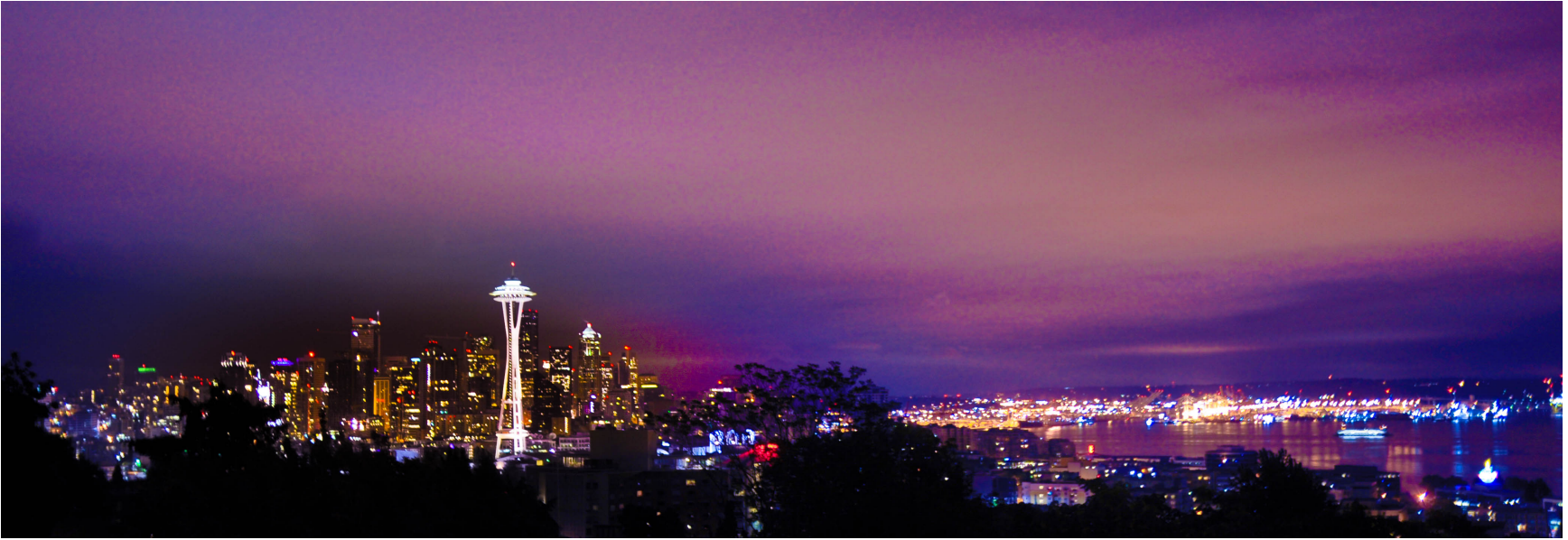
Skyline of Seattle