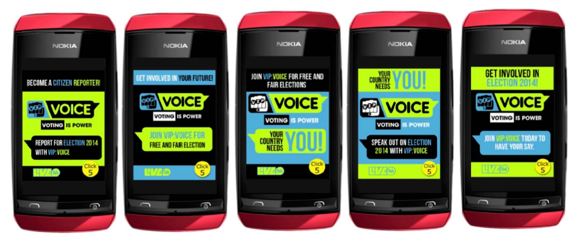
Fig. A1. Example splash screens for recruitment into platform.

In addition to these surveys, presented via drop-down menus, VIP:Voice tracked real-time shifts in political opinion and incidents of political activities. One set of questions, the "Activity" survey, asked about local political activities at three different times prior to election day, randomizing the day on which an individual received the survey A second set of "Thermometer," questions asked about voting intentions and party support. Users could complete surveys in any order, and failure to complete one survey did not preclude answering questions on others. Phase 2 required digital forms of engagement as all activities were limited to interacting with the platform. Of the 90,646 people registered, 34,727 (38%) completed the four demographic questions and 15,461 (17%) answered the demographic questions and one of the other four Phase 2 surveys. See also Ferree et al. (2017) for additional details.