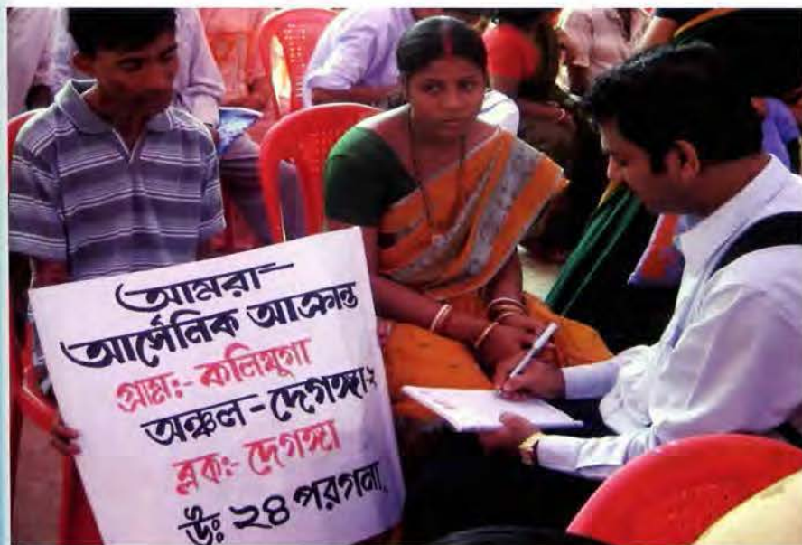
Lawrence Berkeley National Laboratory

The problem of arsenic poisoning in West Bengal and Bangladesh has been called the largest case of mass poisoning in the history of mankind. Two protesters are interviewed at a 2009 sit-in in West Bengal that demanded access to arsenic-safe water and medical treatment.