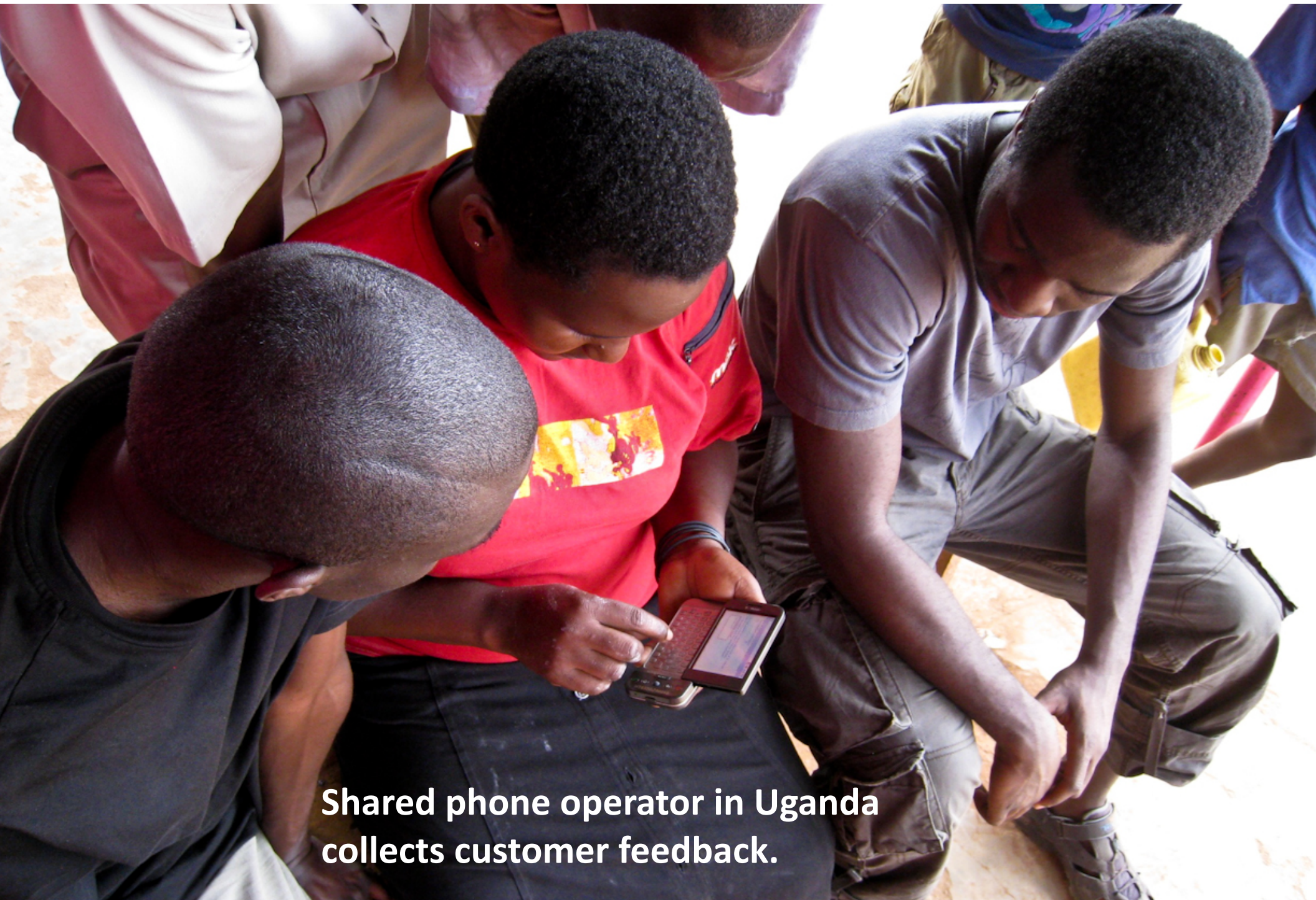
Shared phone operator in Uganda collects customer feedback.