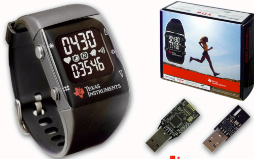
eZ430-Chronos Wireless Development Tool