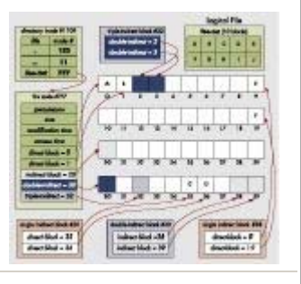
Figure Two: Blocks, inodes, directories, files, and their relationships

Finally, the actual data is written into the blocks.